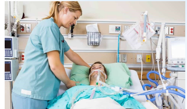
Professional Development for Perianesthesia Nurses