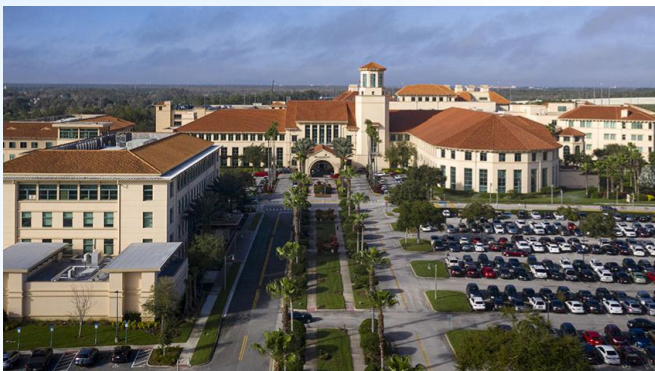
Advent Health Celebration Hospital 400 Celebration Place Kissimmee, FL 34747

The hand outs and practice tests will be mailed to the address you enter into the PayPal site and should arrive within a week of registration.