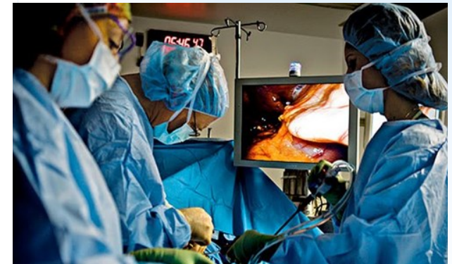
Professional Development for Perianesthesia Nurses

Hudson Valley Community College Main Campus October 19th, 2024