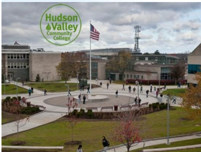
Hudson Valley Community College Main Campus 80 Vanderburgh Avenue Troy NY 12180

The hand outs and practice tests will be mailed to the address you enter into the PayPal site and should arrive within a week of registration.