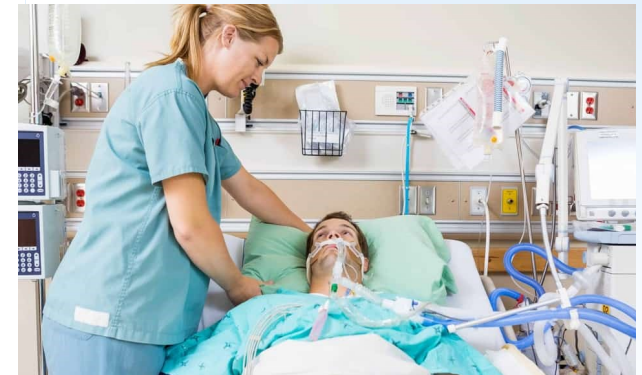
Professional Development for Perianesthesia Nurses

Guthrie Robert Packer Hospital Patterson Building Science Lecture Room February 22-23, 2025 16.25 contact hours provided