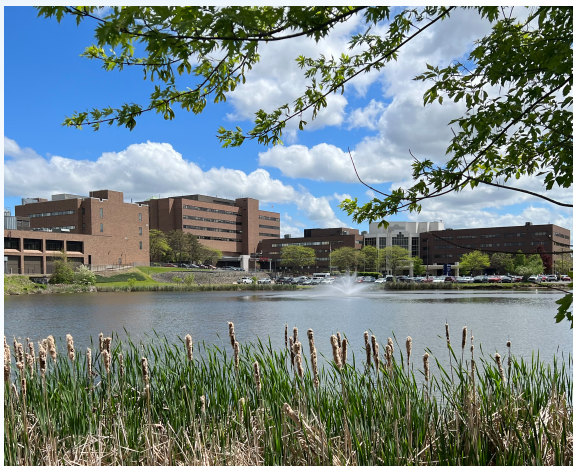
Guthrie Robert Packer Hospital Patterson Building 1 Guthrie Sq, Sayre, PA 18840

Two days of information is presented in a relaxed, professional atmosphere, delivered with humor and real life events that help you to relate the recommended practices to your own perianesthesia nursing practice. You will retain the information for the exam and for years to come.