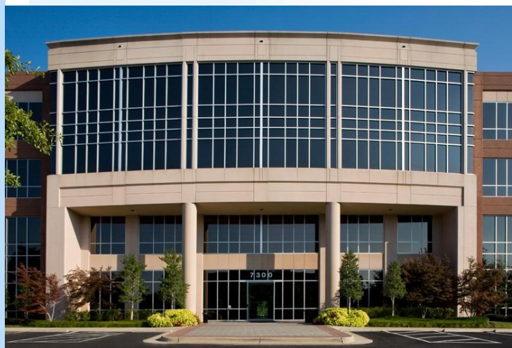
HCA Center for Clinical Advancement at The Boulders 7300 Beaufont Springs Drive BLDG VIII, Richmond VA

You will learn during class how to focus your study and improve your areas of opportunity. I recommend you schedule your exam the month following The CNOR Prep and Review Course.