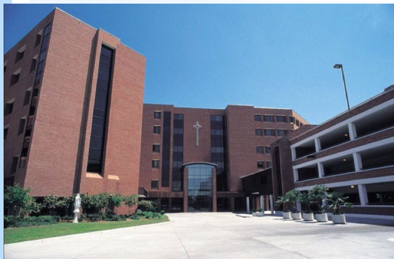
Our Lady of the Lake Regional Medical Center 5000 Hennessey Blvd Baton Rouge, La 70808

Two days of information is presented in a relaxed, professional atmosphere, delivered with humor and real life events that help you to relate the recommended practices to your own perianesthesia nursing practice. You will retain the information for the exam and for years to come.