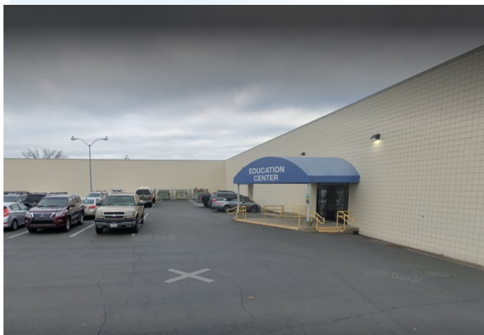
Sacramento Medical Center 3240 Arden Way, Sacramento CA

You will learn during class how to focus your study and improve your areas of opportunity. I recommend you schedule your exam the month following The CNOR Prep and Review Course.