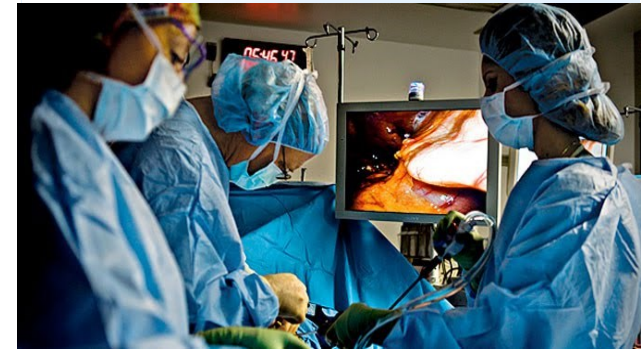
Professional Development for Perioperative Nurses

February 24-25, 2024 16.0 contact hours provided